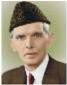
Quaid-e-Azam Muhammad Ali Jinnah

“The economic system of the West has created almost insoluble problems for humanity and to many of us it appears that only a miracle can save it from disaster that is not facing the world. It has failed to do justice between man and man and to eradicate friction from the international field. On the contrary, it was largely responsible for the two world wars in the last half century. The Western world, in spite of its advantages, of mechanization and industrial efficiency is today in a worse mess than ever before in history. The adoption of Western economic theory and practice will not help us in achieving our goal of creating a happy and contended people. We must work our destiny in our own way and present to the world an economic system based on true Islamic concept of equality of manhood and social justice. We will thereby be fulfilling our mission as Muslims and giving to humanity the message of peace which alone can save it and secure the welfare, happiness and prosperity of mankind.”